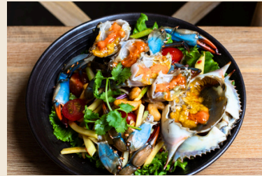
Marinated Crab Salad