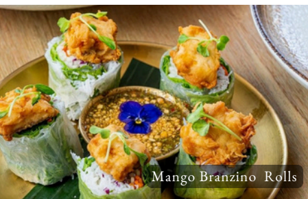
Mango Branzino Rolls