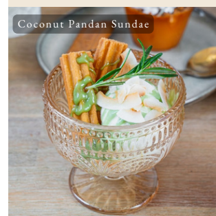
Coconut Pandan Sundae