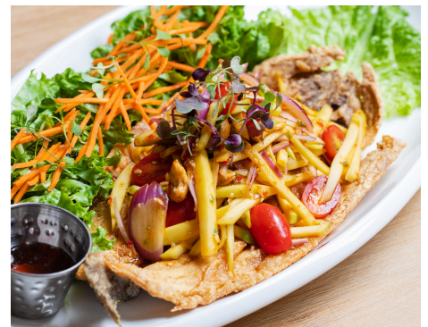
Crispy Sea Bass