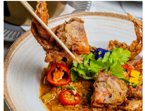
Soft Shell Crab Karee