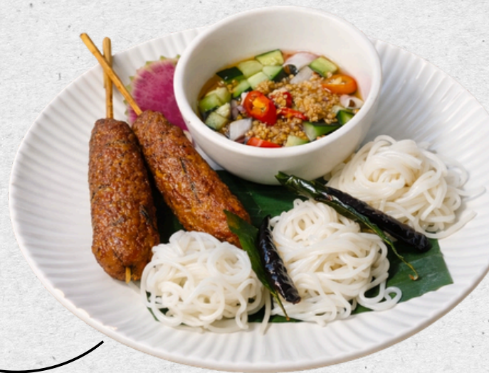
Jang Lon 24.- Fried Thai-herbs shrimp cake, served with rice vermicelli, cucumber relish, ground peanut.