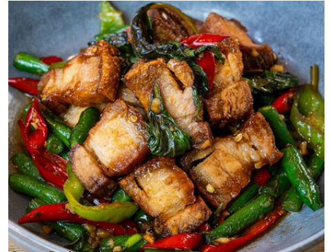
Crispy Pork Belly (Basil)