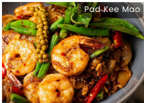
Pad Kee Mao