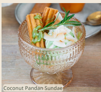
Coconut Pandan Sundae