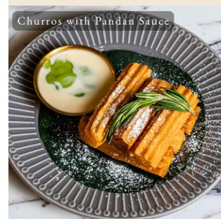
Churros with Pandan Sauce