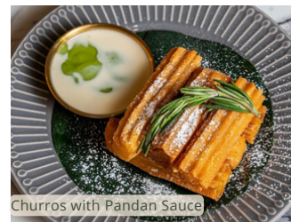
Churros with Pandan Sauce

LYCHEE FIZZ $ 10 Lychee syrup, Lemon, Grenadine, Tonic water