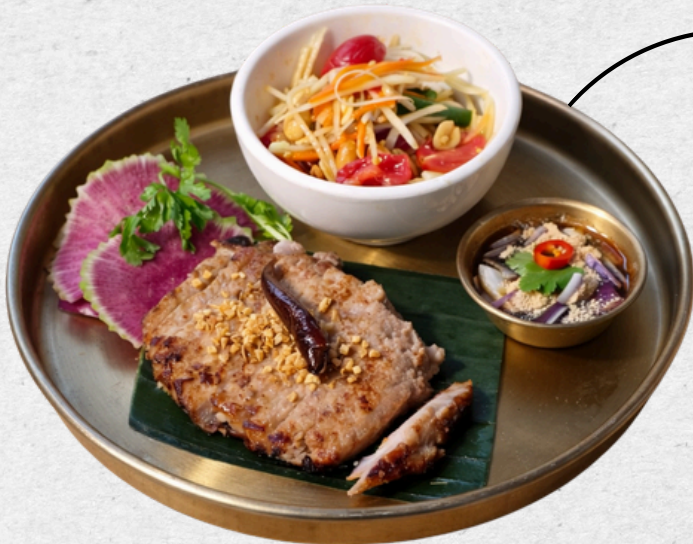
Grilled Pork Chop 30.- Char-grilled pork chop served with spicy Jaew sauce, Som Tum salad, and butterfly-pea flower sticky rice.