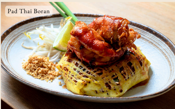
Pad Thai Boran