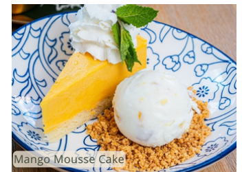
Mango Mousse Cake