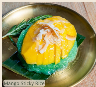
Mango Sticky Rice