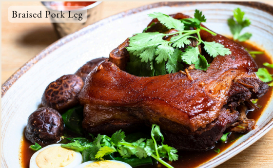
Braised Pork Leg