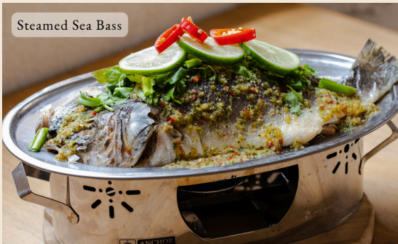
Steamed Sea Bass