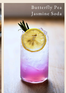
Butterfly Pea Jasmine Soda