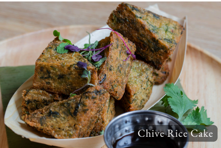
Chive Rice Cake