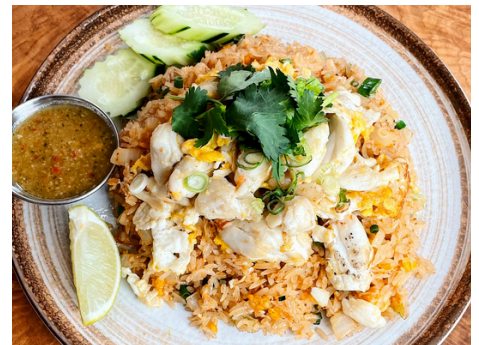
Crab Fried Rice