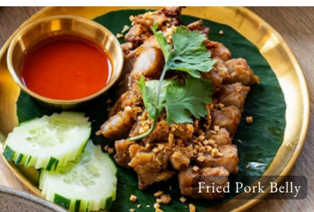
Fried Pork Belly