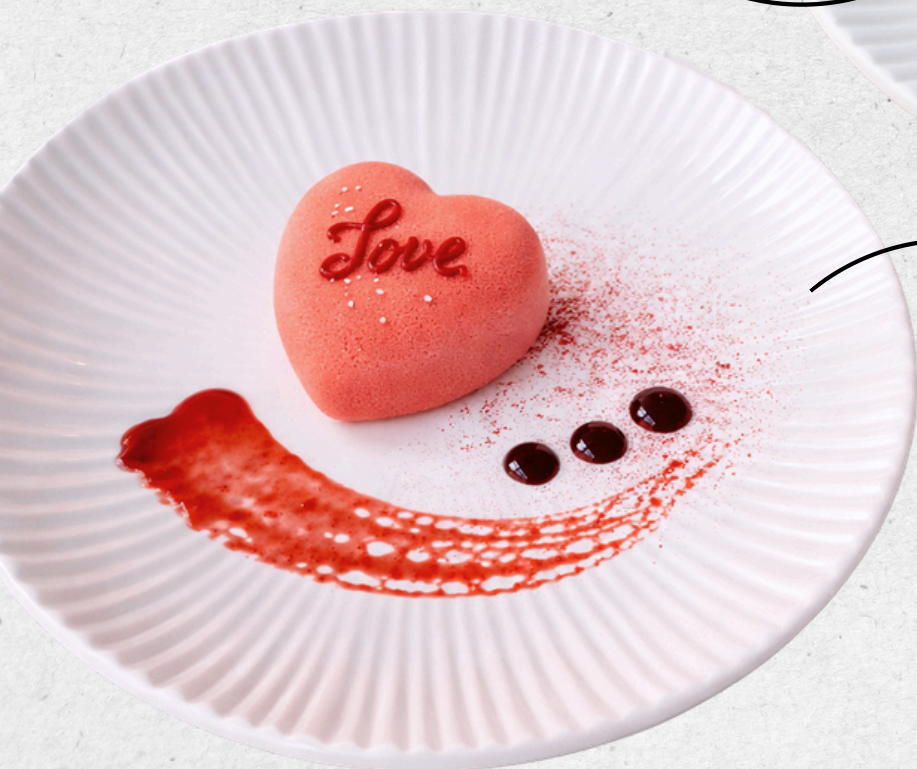
Be My Valentine 14.-

Slow-braised beef brisket stir-fried with spicy Thai curry paste, Thai herbs, Thai eggplant, and basil.