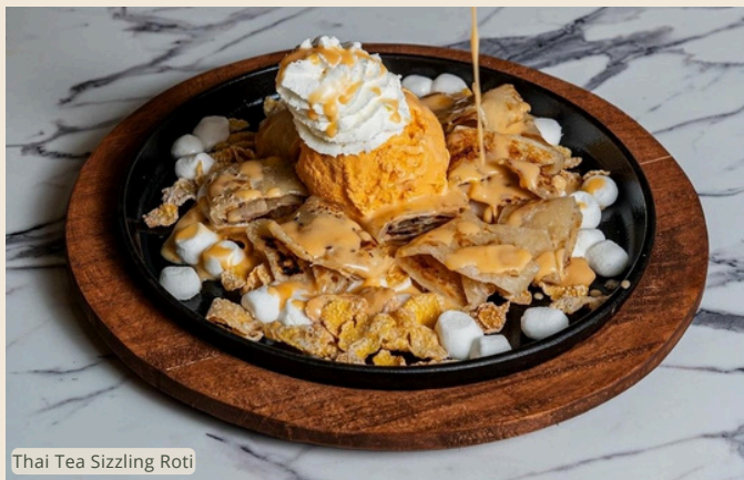
Thai Tea Sizzling Roti

BROOKLYN IPA $ 7 Brooklyn NY, Indian Pale Ale, 6.9%