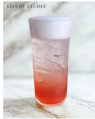
KISS OF LYCHEE