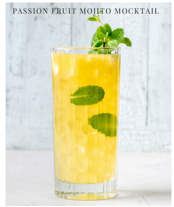
PASSION FRUIT MOJITO MOCKTAIL