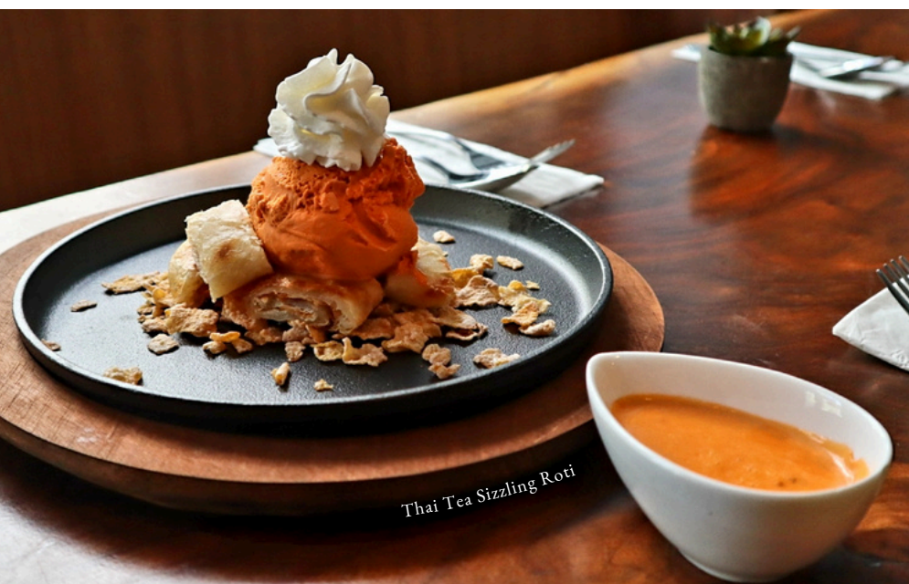
Thai Tea Sizzling Roti