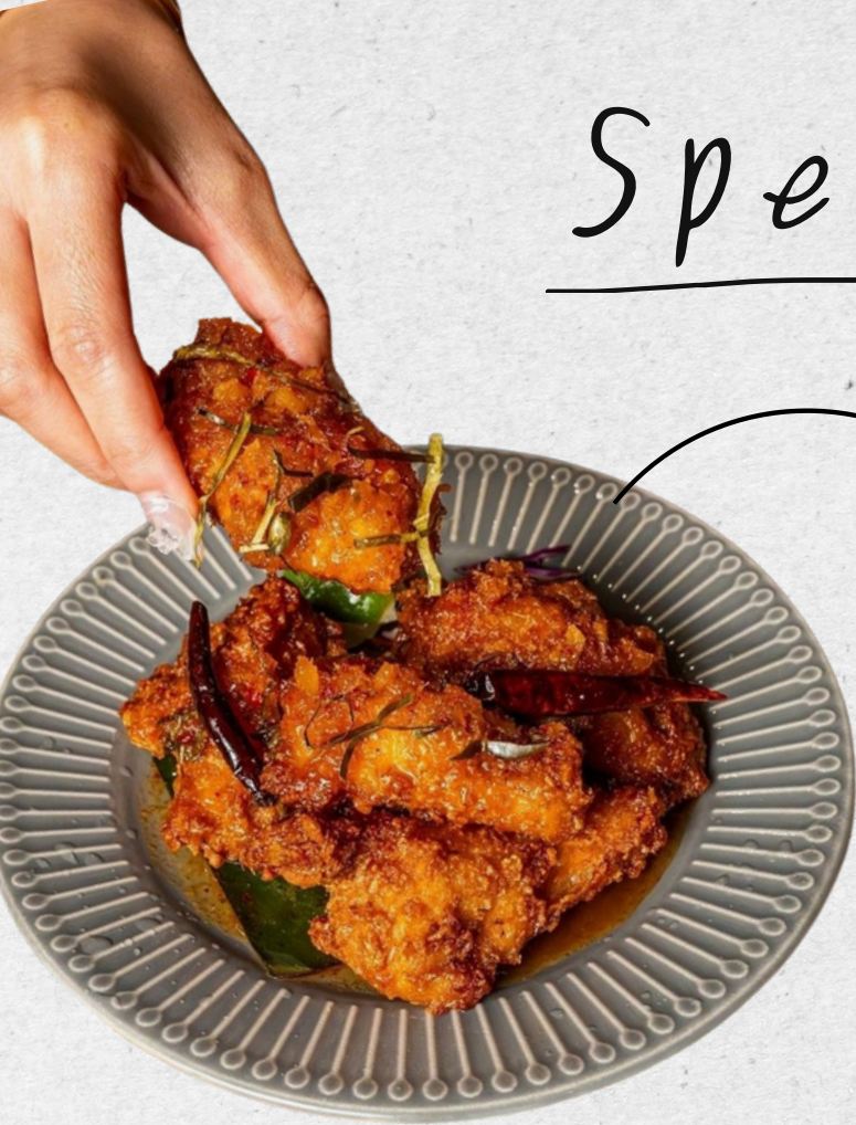
Tom Yum Wings 14.-

Deep fried breaded chicken wings coated with sweet and spicy Tom Yum flavored sauce served with lime.