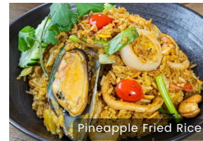
Pineapple Fried Rice

Egg, pineapple, cashew nuts, tomato, onion, and scallion (vegan option available)