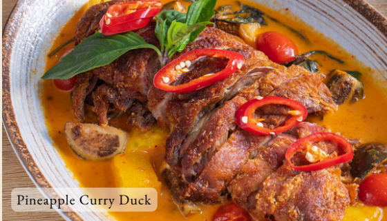
Pineapple Curry Duck