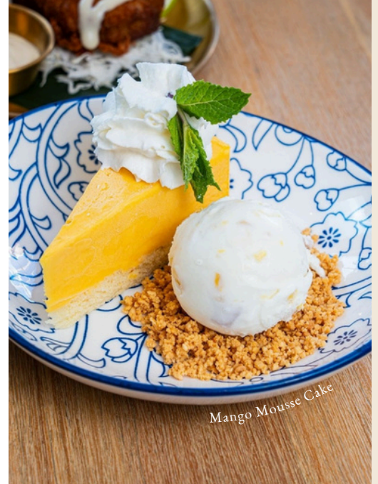
Mango Mousse Cake