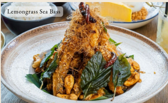
Lemongrass Sea Bass